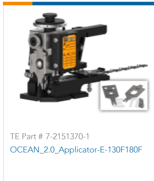
TE Part # 7-2151370-1 OCEAN_2.0_Applicator-E-130F180F