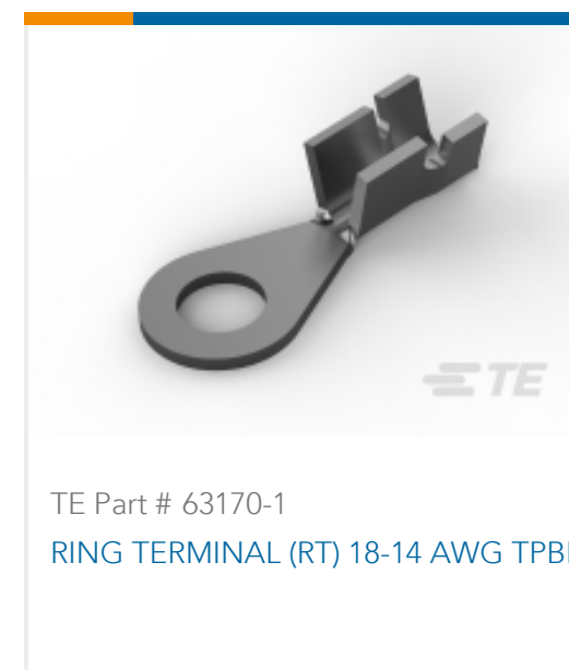
TE Part # 63170-1 RING TERMINAL (RT) 18-14 AWG TPBR