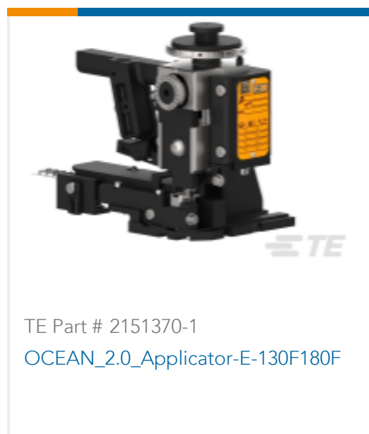
TE Part # 2151370-1 OCEAN_2.0_Applicator-E-130F180F