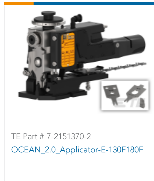
TE Part # 7-2151370-2 OCEAN_2.0_Applicator-E-130F180F