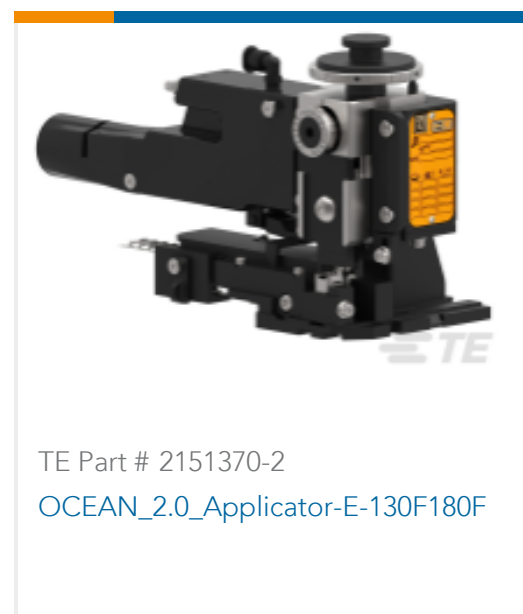
TE Part # 2151370-2 OCEAN_2.0_Applicator-E-130F180F