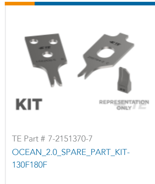
TE Part # 7-2151370-7 OCEAN_2.0_SPARE_PART_KIT-130F180F