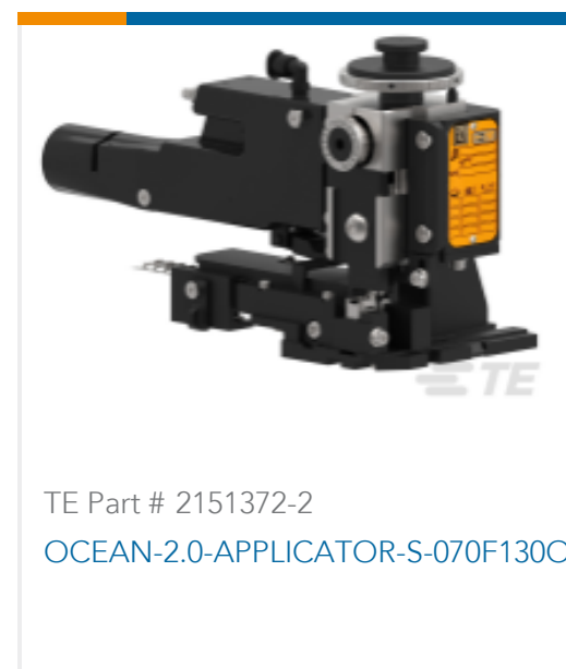
TE Part # 2151372-2 OCEAN-2.0-APPLICATOR-S-070F1300